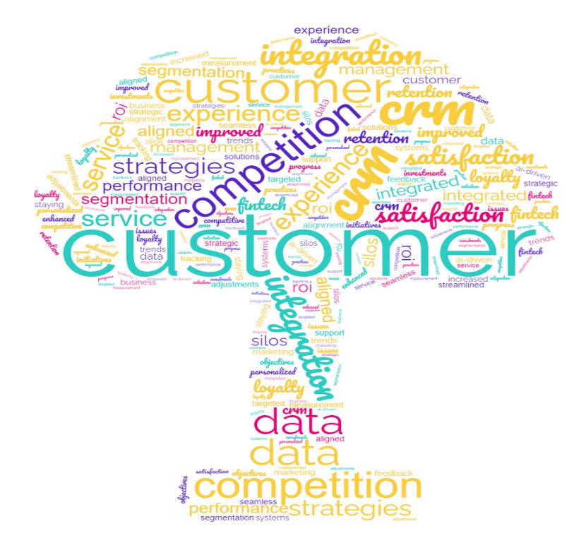
Figure 3. Keywords Word Map

Interviews revealed various CRM best practices the banking industry can use to improve results. Conclusion: prioritize and incorporate client feedback into CRM strategy development. Regular consumer input helped banks understand client needs and improve CRM. A customer-focused business culture was crucial. Customer satisfaction and empowerment at all bank levels improved personalized and responsive services, boosting customer loyalty. Understanding client behavior and preferences with data analytics was another triumph. Data