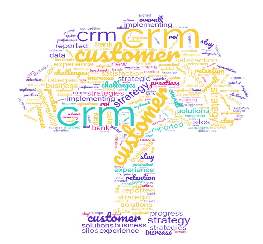
Figure 2. Thematic Analysis Summary

Twenty interviews on improving Chinese banks' CRM through IT and strategy revealed numerous similar themes and insights. Interviewees underlined the importance of IT in CRM duties such as customer segmentation, targeted marketing, and personalized service. CRM initiatives linked with corporate strategy, suggesting a conscious attempt to improve customer experience, explained interviewees. This IT-strategic synergy improved customer satisfaction, loyalty, retention, and performance for many participants. After adoption, an innovative CRM technique increased customer retention by 5% and satisfaction by 10%. Despite these results, interviews revealed data silos, IT integration concerns, and CRM ROI calculation issues. Members saw rising competition from fintech businesses offering cutting-edge CRM solutions. Participants suggested investing in IT solutions to eliminate data silos and simplify CRM integration to increase CRM performance. CRM investment ROI analysis and business plan-complementary CRM strategies were advised ( Table 4 ).