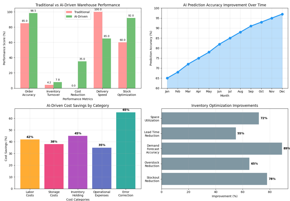
Figure 2: AI-Driven Inventory Management Performance Metrics